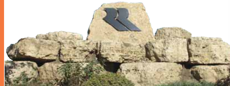
Rock Road Companies, a family-owned business in Janesville, is one of the largest heavy construction road building and asphalt companies in southern Wisconsin.